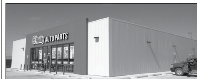
O'Reilly Automotive Stores Inc. closed down their store on Main Street after building a new store on Miller Street, Bethany.