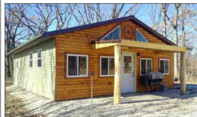
Troy's Four Seasons Yard Care, Inc. constructed this nice new cabin off Highway V in Cainsville.