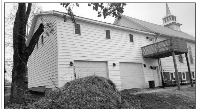
Bruce Hudalla added on a large addition to his home at the corner of 5th Street & Walnut Street in Blythedale