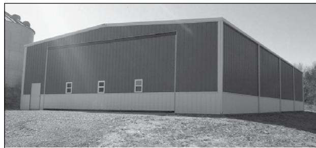
Randall Mulnix put up this new shed on West 375th Street in Bethany.