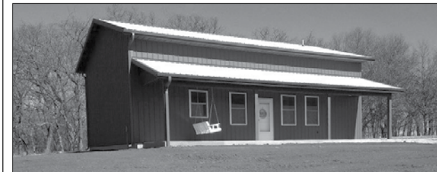
Jodie Graham put up a new camper storage shed at West 110th Street, Eagleville.